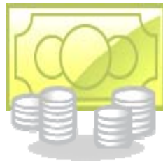
Let VITA help you get the money that is owed to you.

It's that time of year again. As W-2s and other 2010 tax-related documents start arriving in the mail, we are reminded that tax season is nearly upon us. Taxes are due by April 18 th this year. Generally, if you are single and your annual income exceeds $9,350, or you are married with an income of more than $18,700, you must file taxes. Income limits for people over 65, or those using certain other filings statuses, will vary.