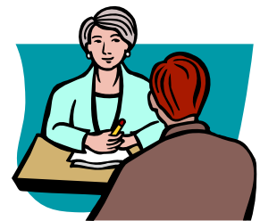
Be prepared for your next interview.

Meridian DOL Office 205 Watertower Lane, Meridian 364-7785